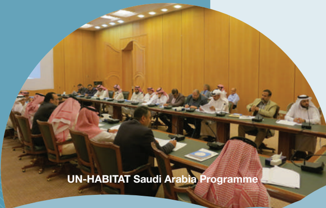
UN-HABITAT Saudi Arabia Programme

See: http://unhabitat.org/tag/saudi-arabia